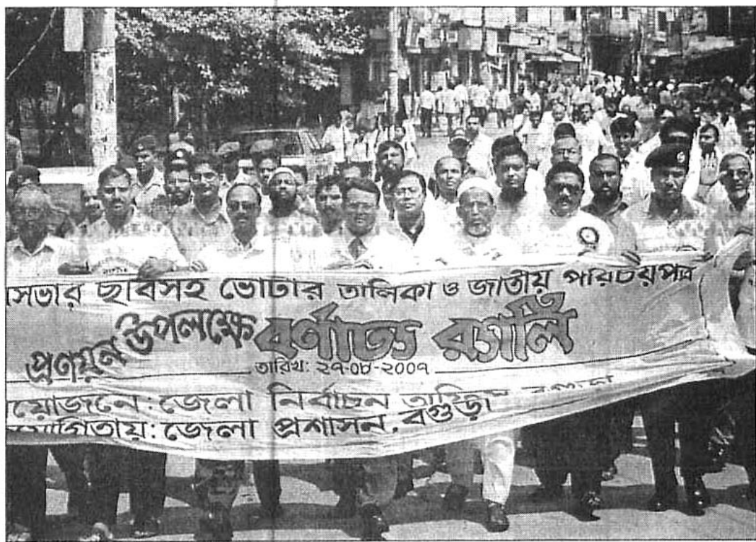
District Election Office brought out a procession in Bogra town yesterday to create mass awareness about voter listing with photo and preparation of national ID card.

Besides, small loans will be provided to the poor families for fish and vegetable farming to make them self-reliant.