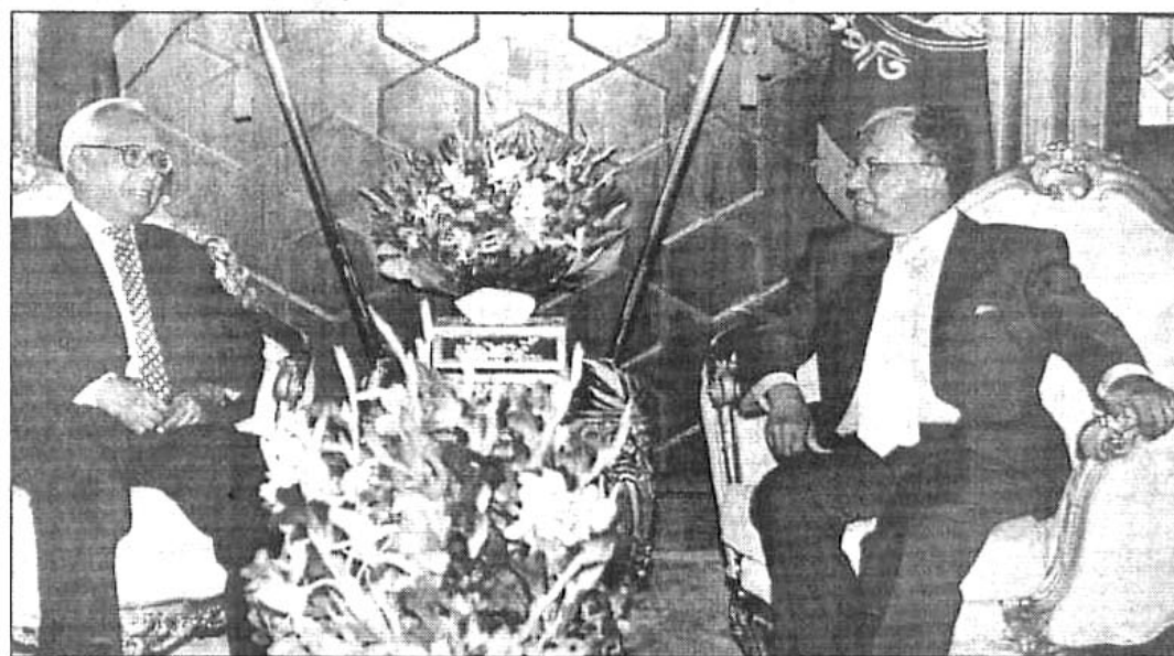
Chief Adviser Fakhruddin Ahmed calls on President Iajuddin Ahmed at Bangabhaban in the city yesterday.

The report also said the government should form an Emergency and Crisis Coordination Arrangements Organisation to face the consequences of any terrorist attacks.