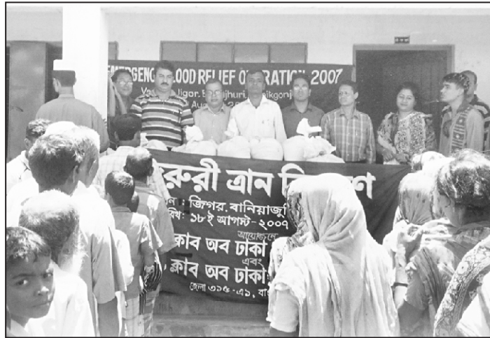
Members of the Lions Club of Dhaka Karwan Bazar District 315-A1 distribute relief among flood-affected people at Baniyahuri in Ghior, Manikganj recently.