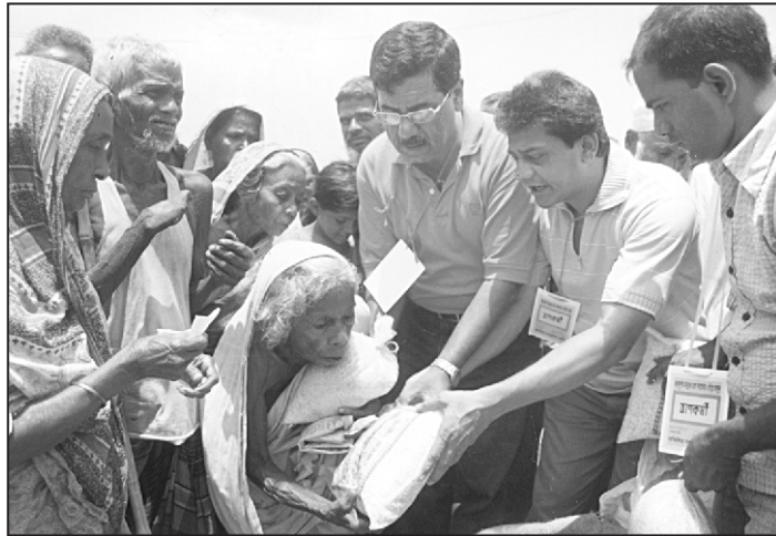
Members of the Lions Club of Dhaka Karwan Bazar District 315-A1 distribute relief among flood-affected people at Baniyahuri in Ghior, Manikganj recently.