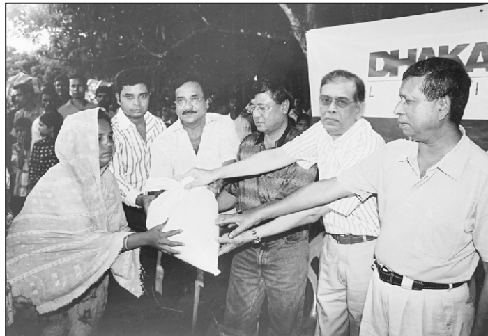
Dhaka Bank officials distribute relief among flood victims at Araihaazar in Narayanganj recently.