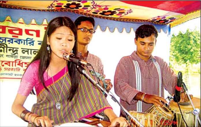
An artiste sings at a cultural programme organised recently by Khagrachhari Government College at its premises