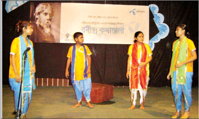
Young actors of Little Theatre participate in a play in observance of Rabindranath Tagore's death anniversary organised by Bogura Theatre. The programme was sponsored by Grameenphone