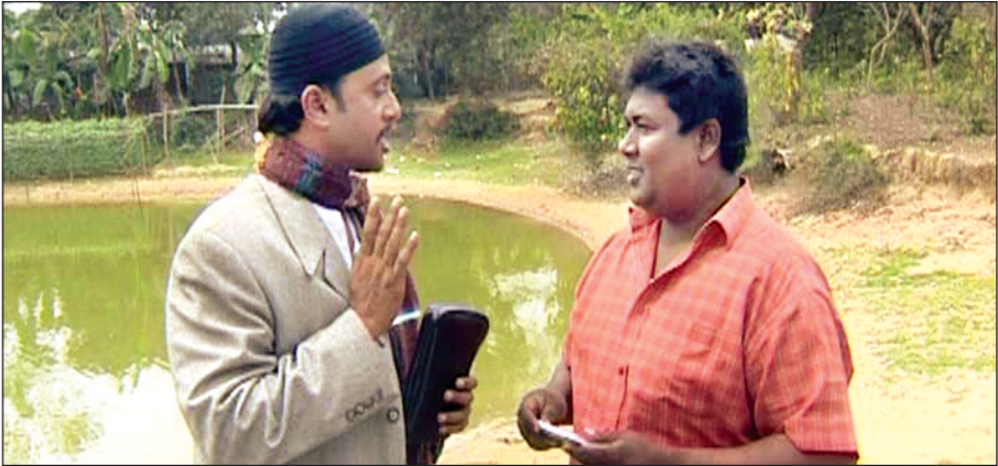
Riaz (L) and co-actor in the drama serial