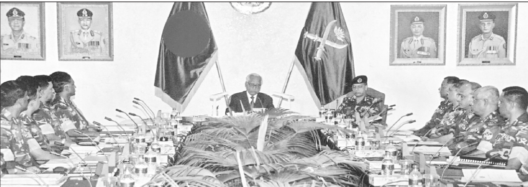
President Iajuddin Ahmed speaks at the Army Headquarters Selection Board-2007 meet at Dhaka Cantonment yesterday.