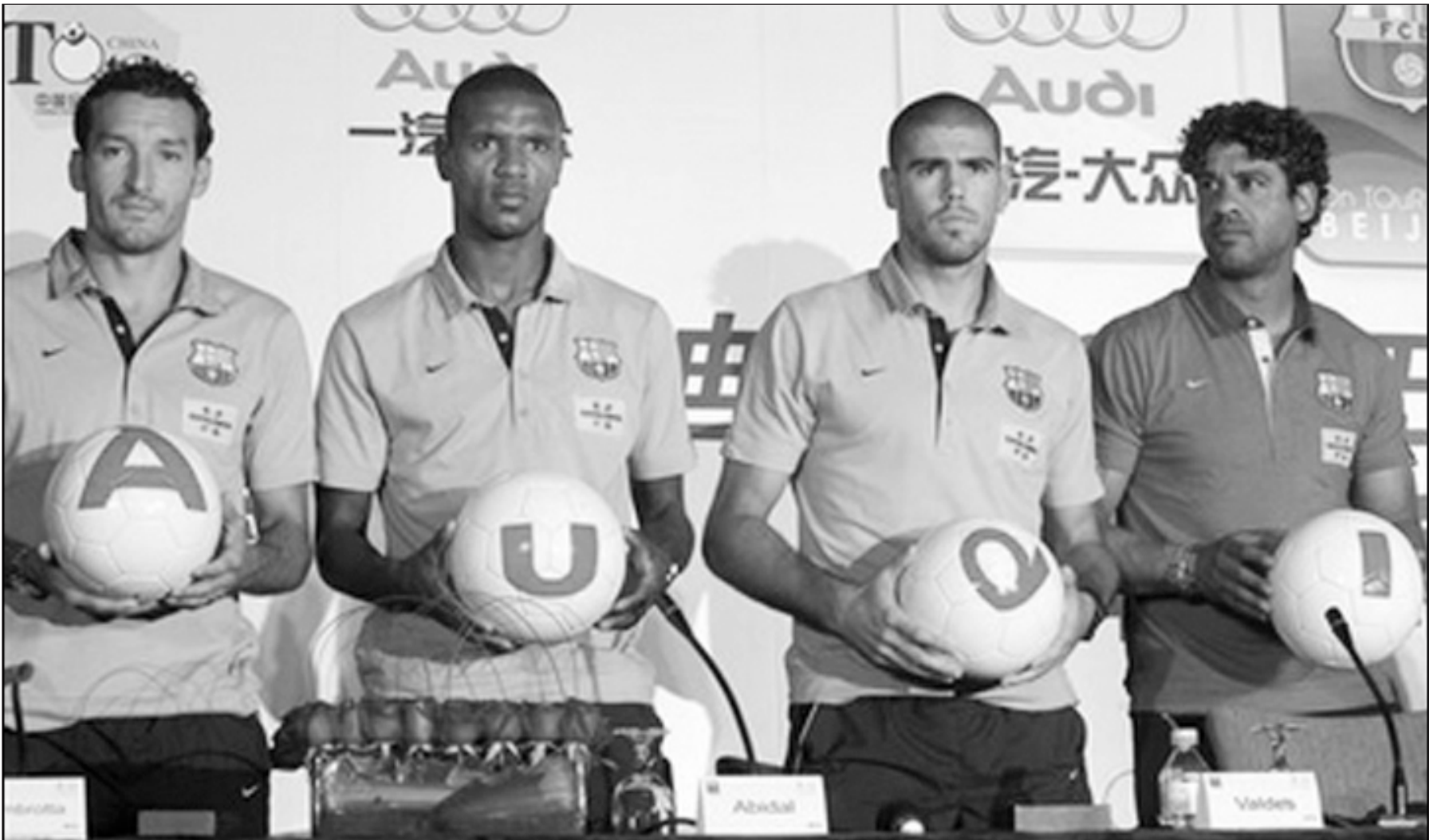
Barcelona players Gianluca Zambrotta (L), Eric Abidal and Victor Valdes stand alongside coach Frank Rijkaard (R) as they form the name of their sponsor engraved in balls during a press conference in Beijing on Friday.