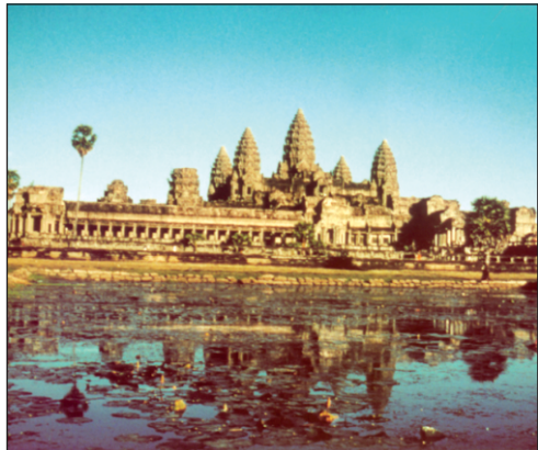
Asia Rising On Discovery Channel at 9:30pm Programme featuring the ruins of Angkor