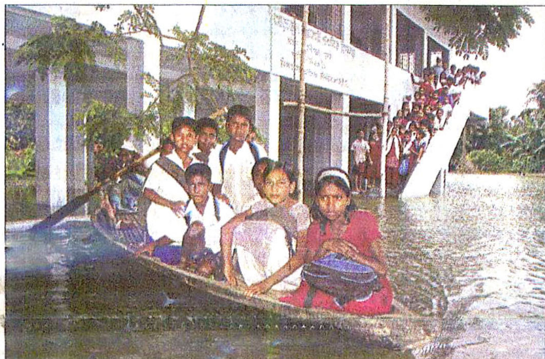
Students of Arakul Government Primary School in Keraniganj use boats as transport to and from the school with floodwater inundating the locality.