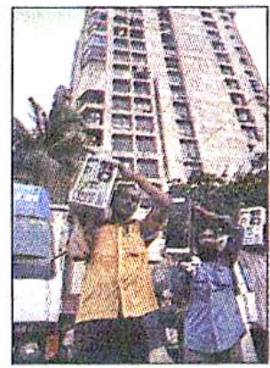
Equipment being removed from Rangs Bhaban ahead of its demolition.

The apex court judgment cleared the way for the Rajdhani Unnayan Kartripakkha (Rajuk) to demolish the unlawful structure beyond the SEE PAGE 19 COL 1