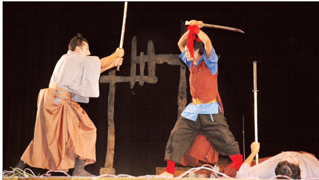
Young actors from different troupes perform in the play