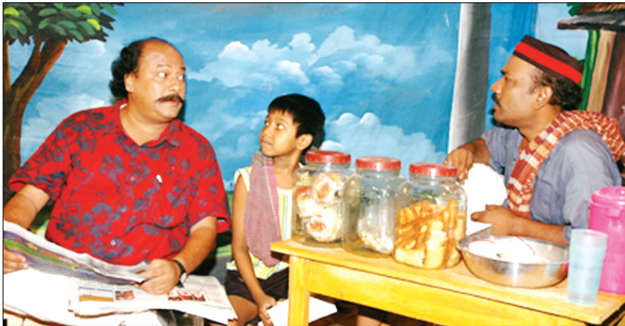
A scene from the serial