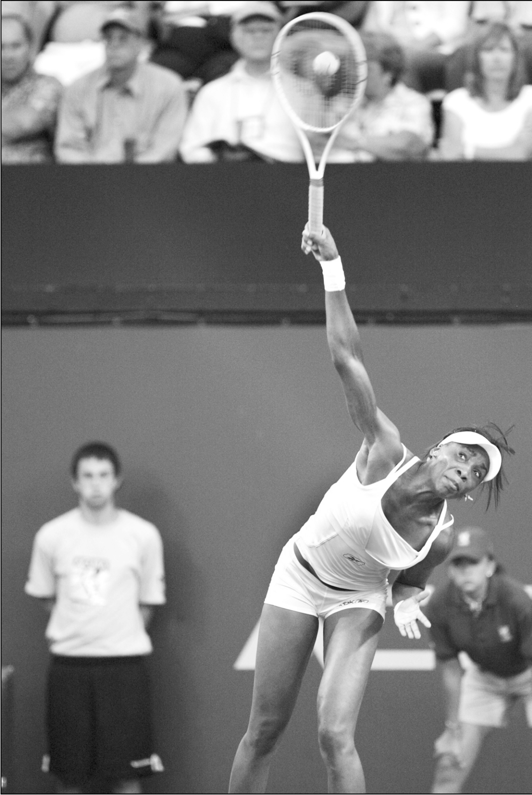
Venus Williams of USA serves to Russia's Anastasia Rodionova during her first round WTA San Diego Classic match held in San Diego on Monday.

"It wouldn't upset me if I had to go because I know there are other big clubs in the world I could play for."