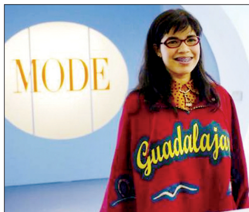
Ugly Betty On Star World 9:30pm

TV Series Cast: America Ferrera, Eric Mabius