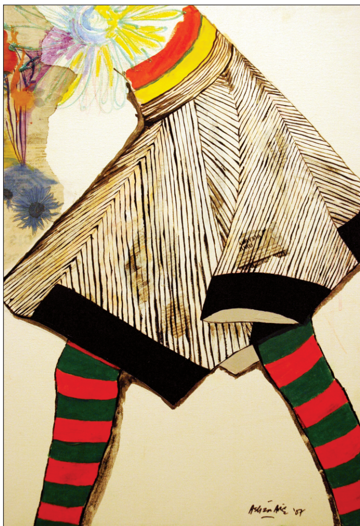
A painting by Asliza Aris