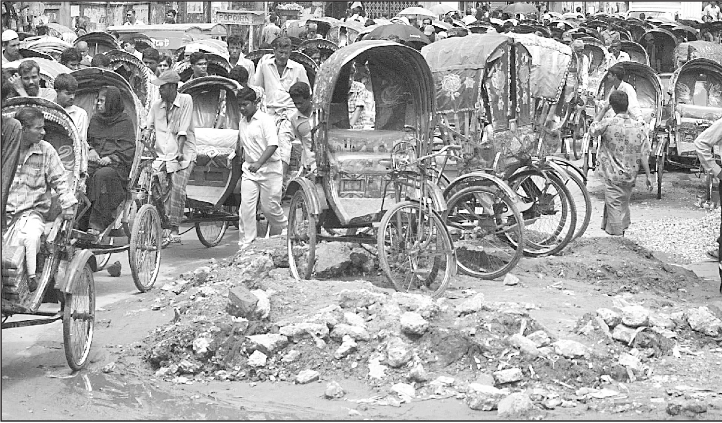
Bricks and piles of earth on a road at Laxmibazar add to traffic congestion in the area. The picture was taken yesterday.