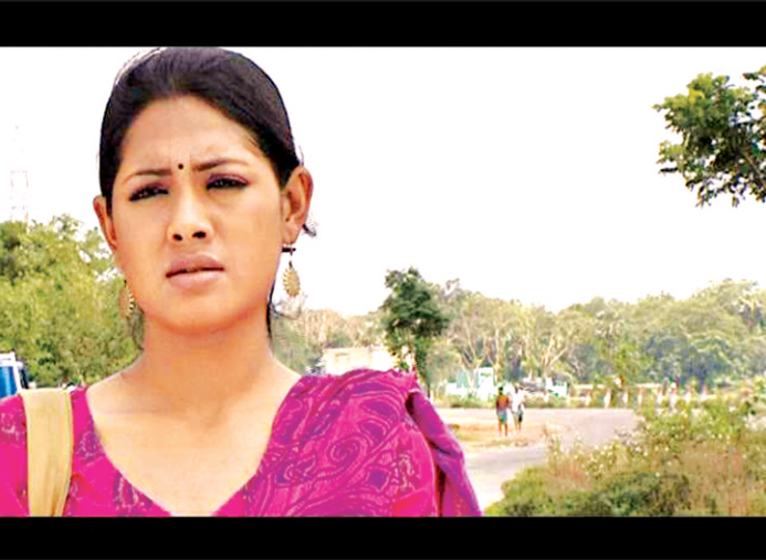
Tisha in a scene from Coffee House