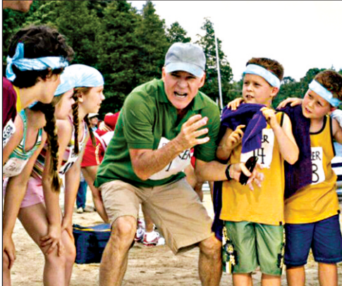
Cheaper by the Dozen 2 On Star Movies at 8:40pm Genre: Comedy Cast: Steve Martin, Eugene Levy

All programmes are in local time. The Daily Star will not be responsible for any change in the programme.