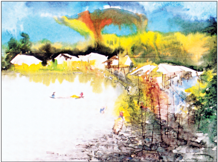
Moment by Wazmun Nahar Runty

This photo of two children under a makeshift shed, getting drenched in torrential rain, has been selected as the best photograph at an exhibit arranged by National Institute of Mass Communication (NIMCO). The photograph is by Imshiat Shareef, a photo-journalist working for Naya Diaganto . Around 70 images by photojournalists and freelance photographers are on display at the exhibition that will continue till Thursday (August 2)