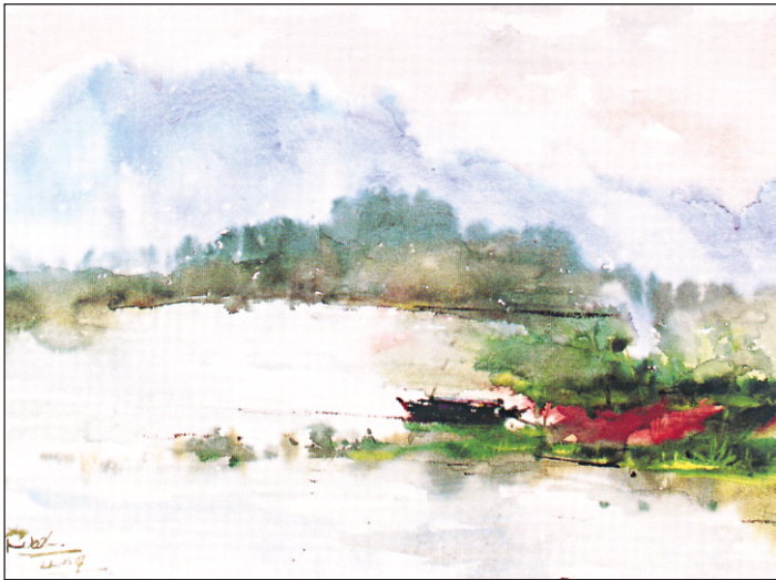
Study 2 by Mahfujul Islam Rubel

The results of the art camp are well worth visiting. The exhibition ends on August 7.