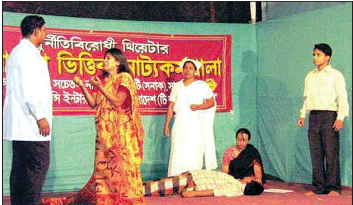
Actors of Gana Natya Dal in the play

On the talent hunt, DrockStars , Bappa said that initiatives such as this can have a positive impact on our music in many ways. "The programme is creating opportunities for budding musicians to demonstrate their potentials, which will be beneficiary for them as well as for the music industry. Besides, the show has become a platform for popular bands, exchanging views, which is also essential for our music," added Bappa.