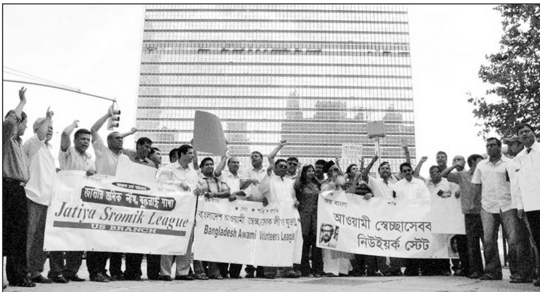
US chapter of Awami League stages a demonstration in front of the United Nations Building in New York yesterday demanding release of AL President Sheikh Hasina.

Doa was also offered at Anandabazar mosque at Shewrapara for the peace of the departed soul.