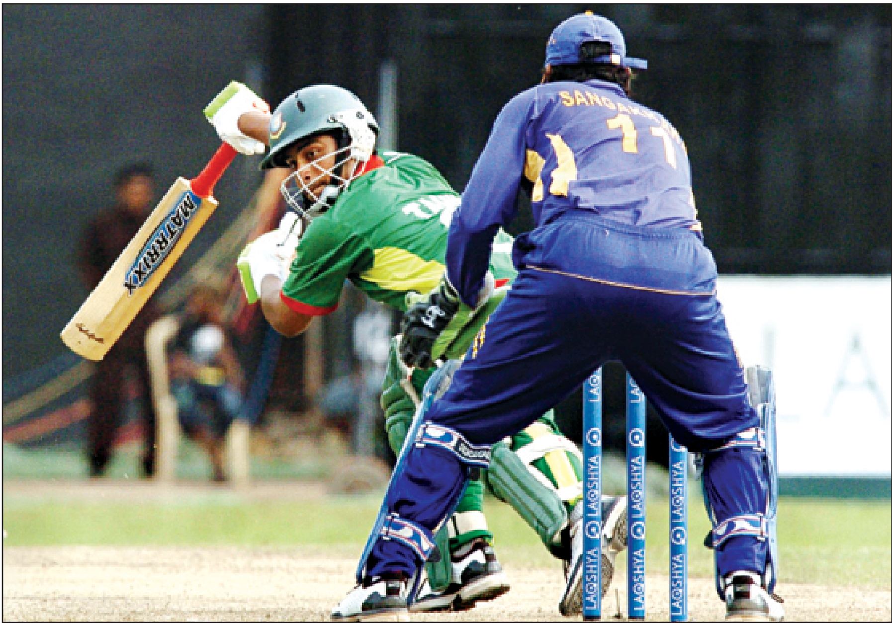
Bangladesh opener Tamim Iqbal runs the ball to third-man during his half-century in the third and final one-day international at the R Premadasa Stadium in Colombo on Wednesday.