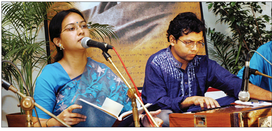
An artiste renders a Tagore song

Chhayanat's regular musical programme, "Shrotar Asar", this time brought some rain songs of Kabiguru Rabinranath Tagore to