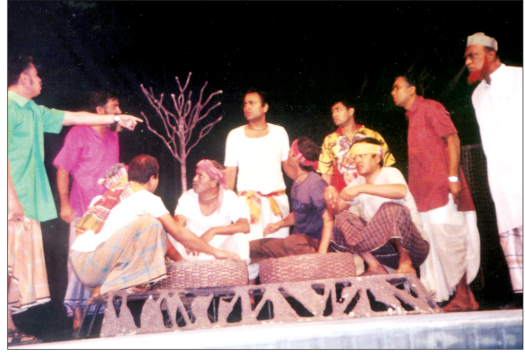
Artistes of Dhaka Padatik perform in Jalodash

As part of the ongoing Citycell-Mahakal Theatre Festival '07, Dhaka Padatik will stage Jalodash today at the Experimental Theatre Stage. Written by Harun-ur-Rashid and directed by Nader Chowdhury, the play features plight of the fisherman community and brings to light the various ways hoarders manipulate and exploit these people. Jalodash also touches the issue of exploitation of the poor by several NGOs in the