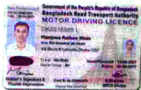
যেকোন ফটো আইডেন্টিটি কার্ডের ফটোকপি (ড্রাইভিং লাইসেন্স, বন্ধুকের লাইসেন্স ইত্যাদি)