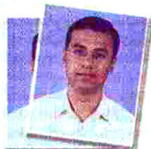
২ কপি পাসপোর্ট সাইজ ছবি

সরকারী নির্দেশনা অনুযায়ী মোবাইল সংযোগ কিনতে নির্দিষ্ট ফর্ম পূরণ করে ছবি ও পরিচয়পত্র জমা দেয়া বাধ্যতামূলক