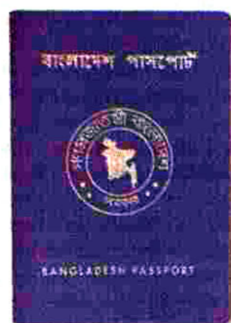
পাসপোর্ট এর ফটোকপি