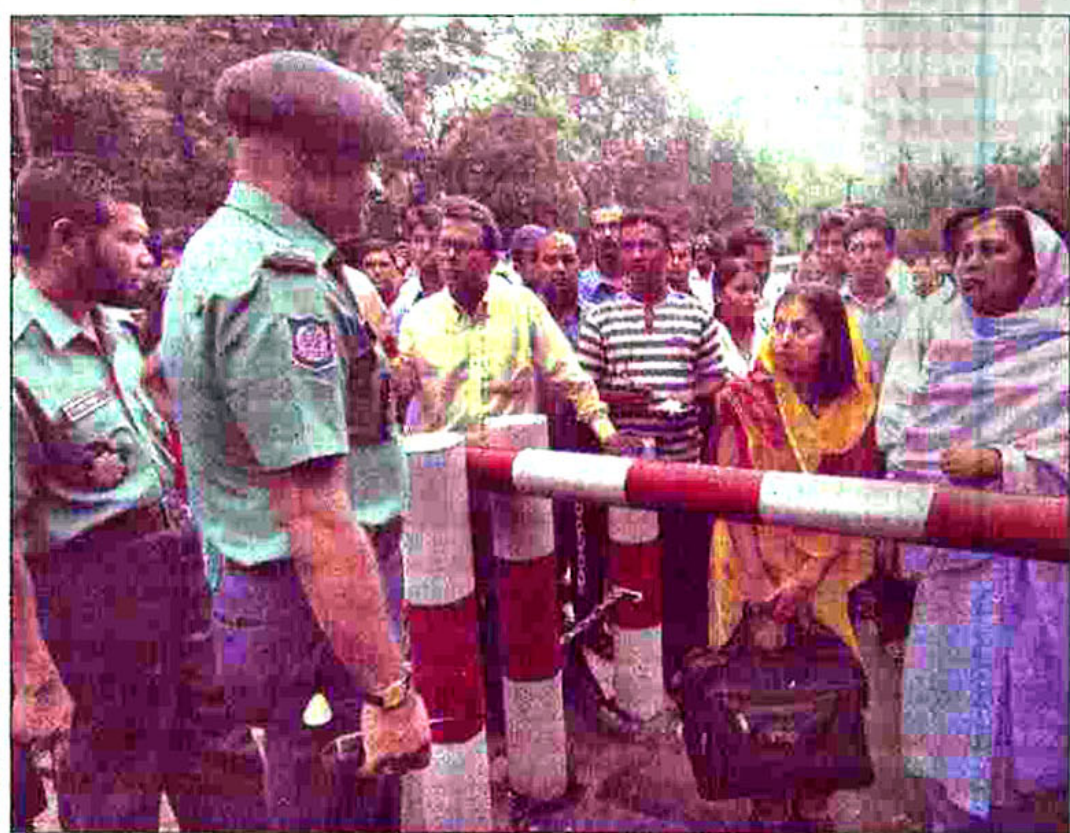
Policemen on guard at the sub-jail on the Sangsad Bhaban premises prevent relatives of Awami League chief Sheikh Hasina from visiting her yesterday.