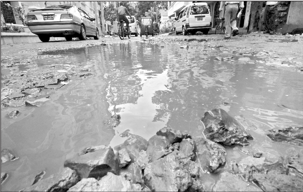
With potholes filled with rainwater, Gulshan Road No 108 in the city lies in a dilapidated condition, causing immense suffering to commuters and pedestrians, but the authorities have turned a blind eye to the problem. The picture was taken yesterday.