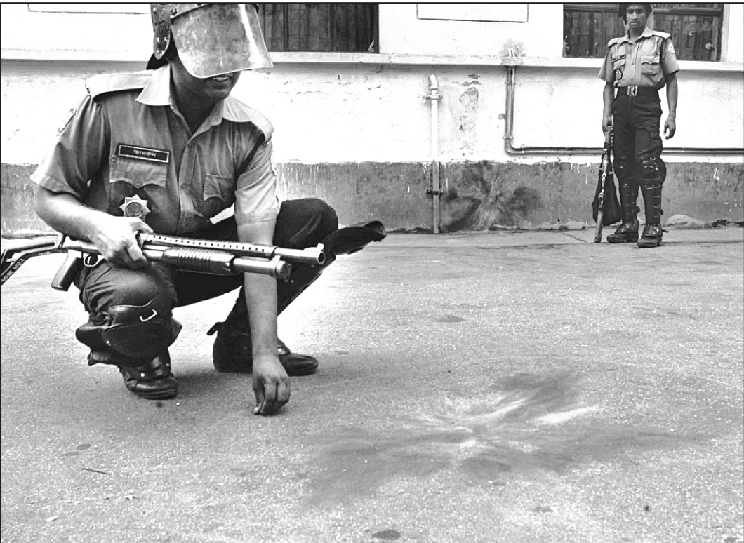
A policeman inspects the site where three bombs exploded on the Dhaka University campus as some unknown persons hurled the bombs near the vice-chancellor's office yesterday.