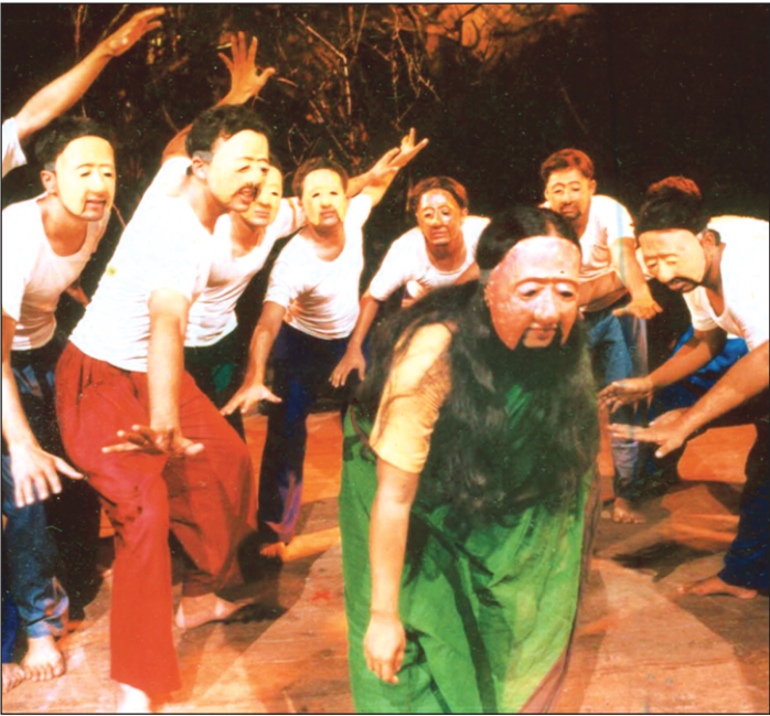
Actors of Udichi in Bou Boshanti