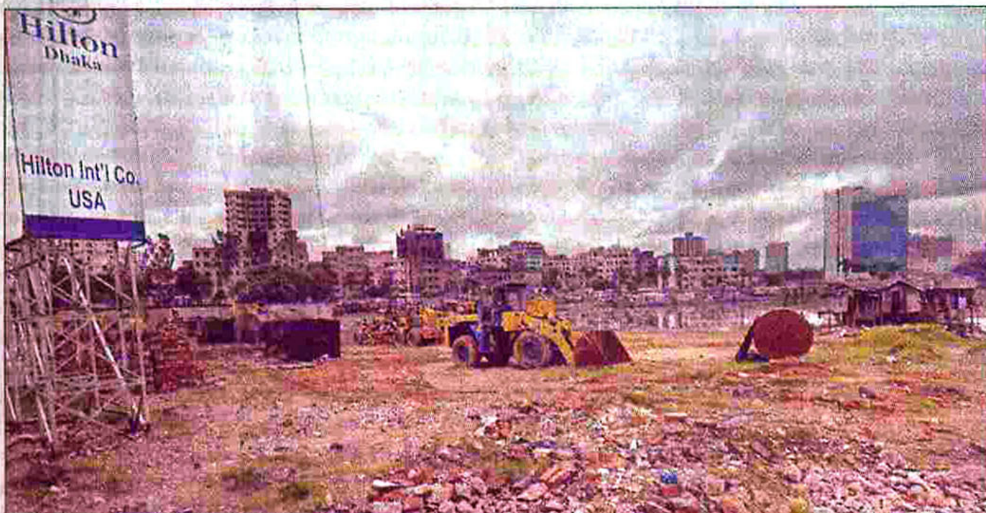
Developers continue their work in the Hatirjheel canal in the capital as the authorities are yet to take any step to stop it despite recent commitment to save the waterbody.