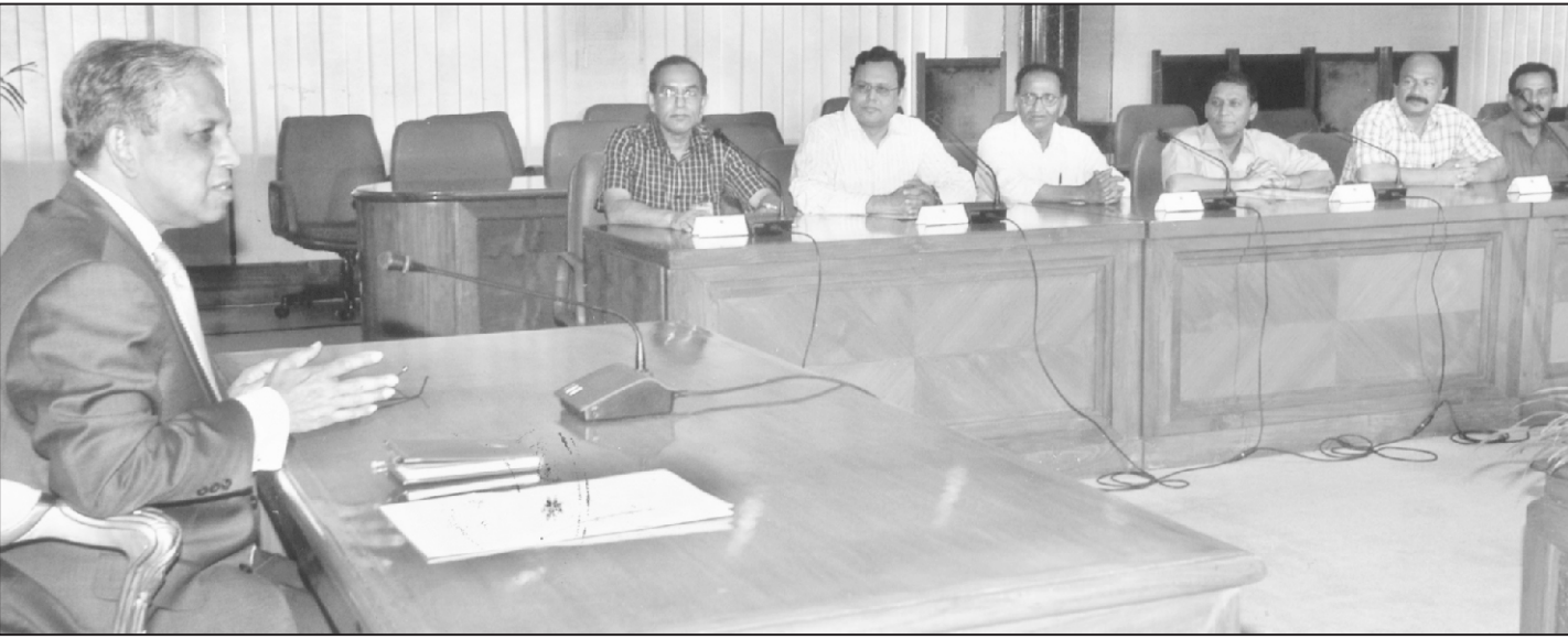
Chief Adviser Fakhruddin Ahmed addresses the leaders of Sangbadik Sramik Karmachari Oikya Parishad at his office in the city yesterday.