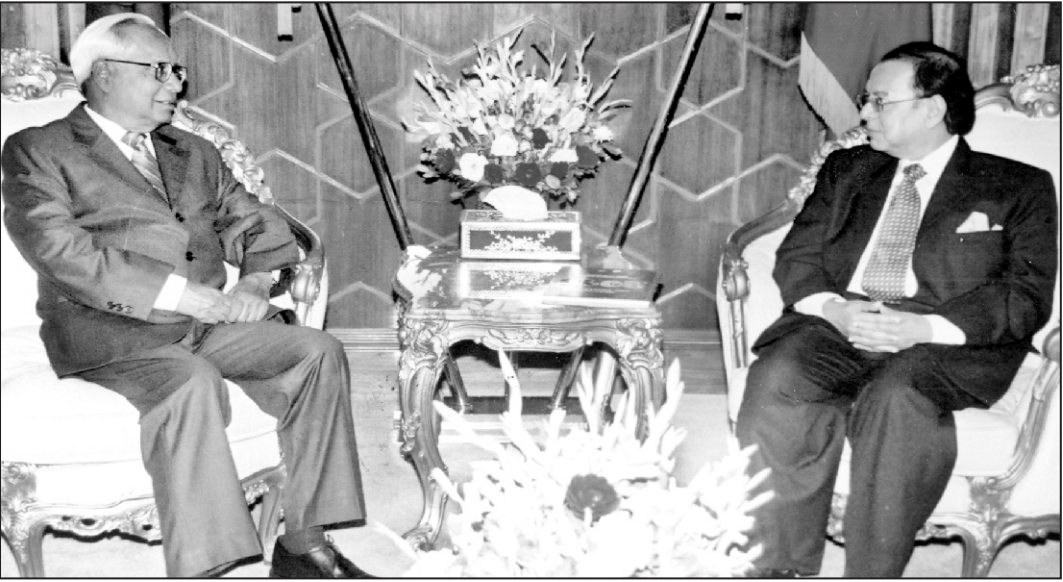
Foreign Adviser Iftekhar Ahmed Chowdhury makes a courtesy call on President Iajuddin Ahmed at Bangabhaban yesterday.

Biplobi Communist Party, four from Gono Mukti Fouz, one from Jatiyo Samajtantrik Dal, three from Sromojibi Mukti Andolon, four from Sarbahara Party and one from United Peoples Democratic Front. Odhikar calls on the caretaker government to initiate an independent judicial inquiry into the extra-judicial killings. The report was prepared on the basis of stories published in 11 national dailies and its own fact-finding reports.