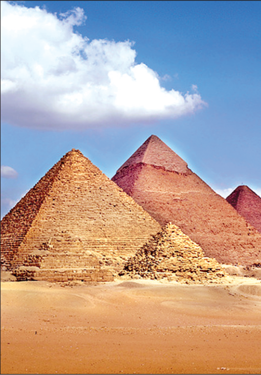
The Giza pyramids