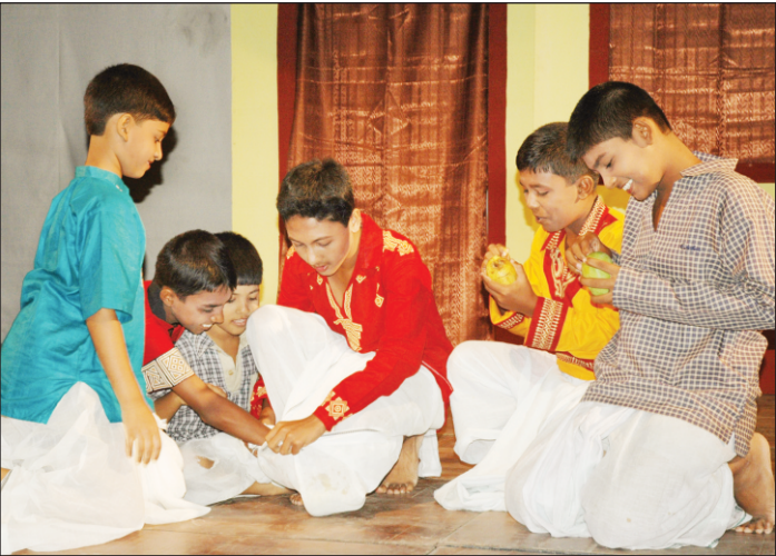
Young actors perform in the play Damal Chhele Nazrul