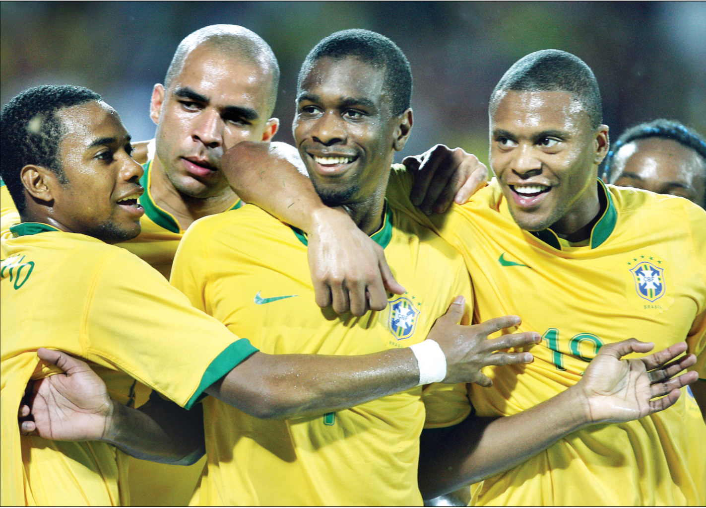
Brazil goal scorers Robinho (L), Juan (C) and Julio Baptista celebrate Juan's goal with teammate Alex (2nd L) during their drubbing of Chile in the quarterfinal of the Copa America in Puerto La Cruz on Saturday.