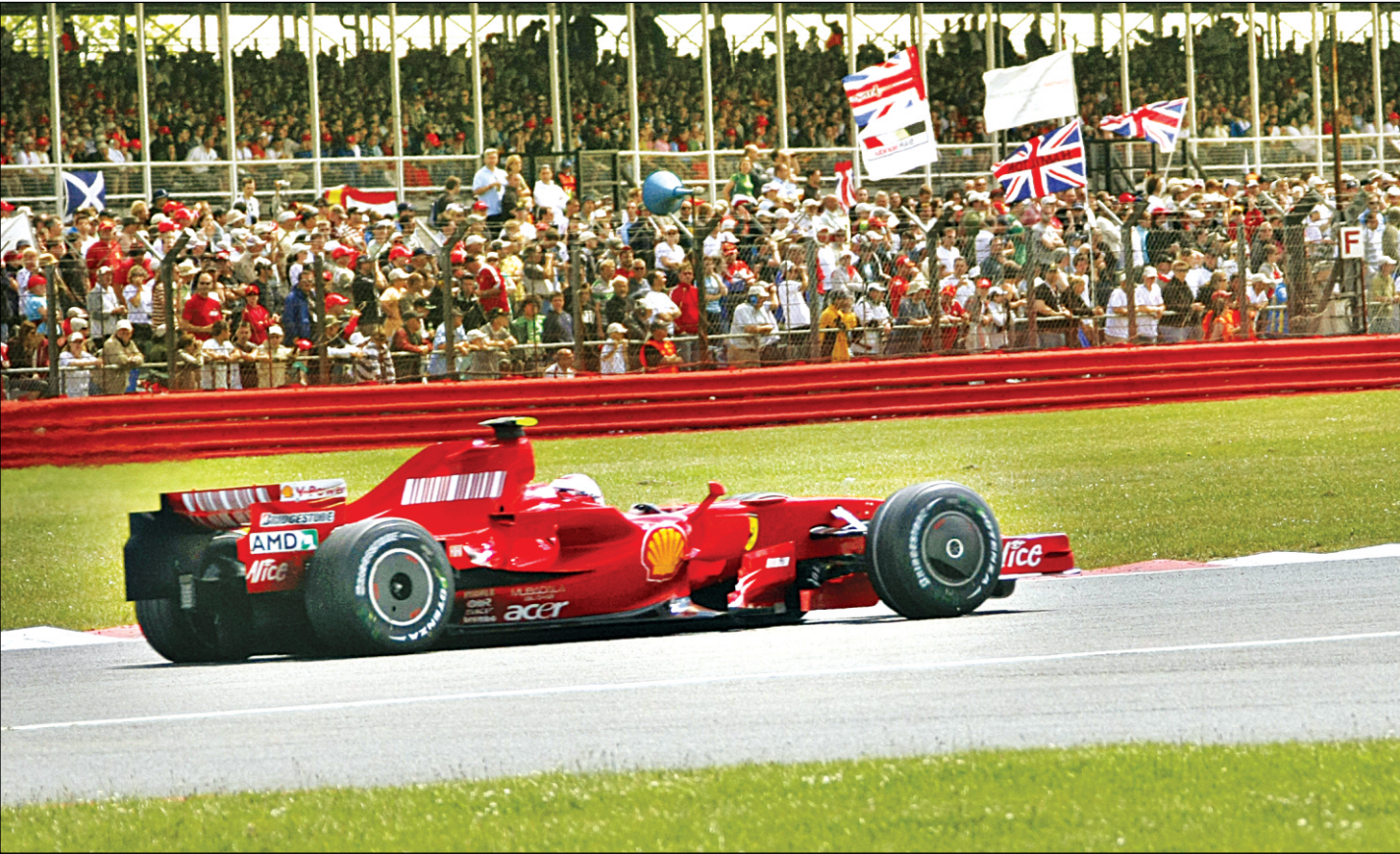
Ferrari's Finnish driver Kimi Raikkonen races through the Silverstone racetrack during the British Grand Prix yesterday. Raikkonen won the race ahead of McLaren duo Fernando Alonso and Lewis Hamilton.