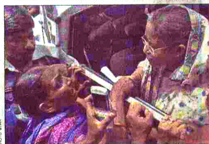
A woman tries to talk with Awami League chief Sheikh Hasina in front of Labaid hospital in the capital yesterday. Hasina went there to visit ailing singer Sabina Yasmin.