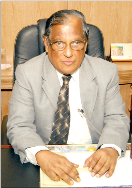
Tonight's guest Akbar Ali Khan

BTV's popular monthly lifestyle talk show Swapno will be aired tonight at 10:30pm. Renowned economist and former advisor to the caretaker government Dr. Akbar Ali Khan will appear on the show. His life and career will be highlighted in the 30 minute programme.