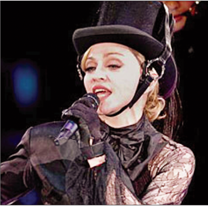
Madonna leads the London event

But critics say that it lacks achievable goals, and that bringing in jet-setting rock stars in fuel-guzzling airliners to plug in to ampli-