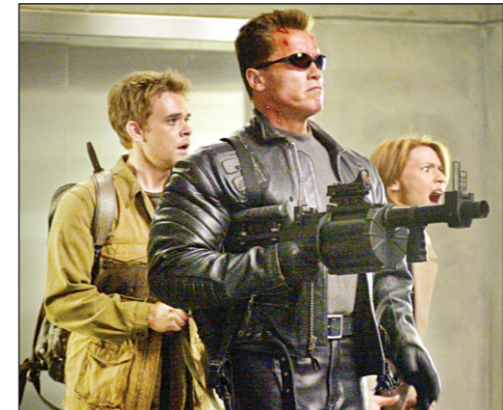
Terminator 3: Rise of the Machine On Star Movies at 8:35pm

05:10 R-Music 06:00 Din Protidin 06:35 Gaan Ar Gaan 08:00 Drama Serial: Biyer Golpo 08:50 Wide Angle 09:20 Drama Serial: Raat Jaga Pakhi 09:30 12:00 01:00 01:30 03:30 04:00 04:30 07:30 08:00 09:15 10:00