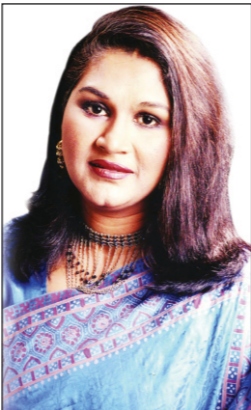
Shomporko On ntv at 8:50pm

09:05 Praner Manush Achhey Praney 09:30 Tele Film: Ekhone Kuasha 12:00 Just Band 01:00 Bishwa Jurey 01:30 Aj Potrikay 03:45 Documentary 04:20 Path Chacatei Anondo