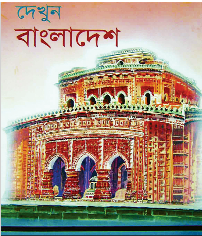
Art works by the students of Institute of Fine Arts on display