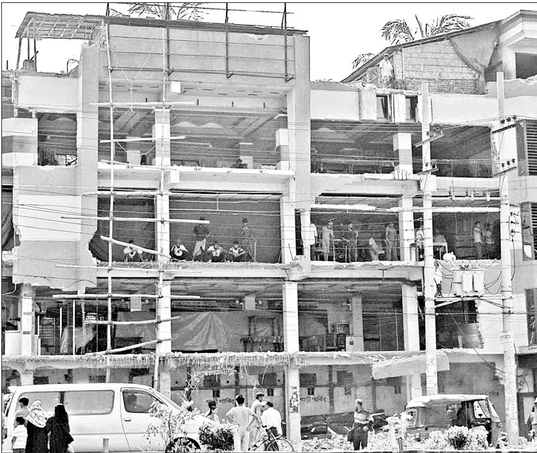
Chittagong City Corporation began demolishing illegal structures at GEC Square in the city yesterday.