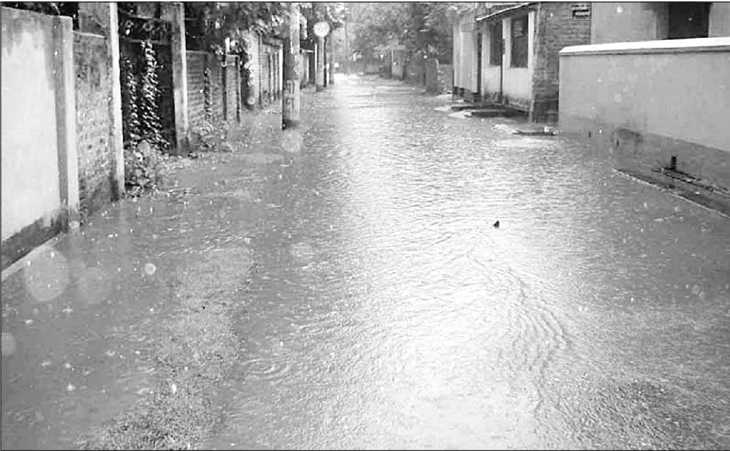
A shower swamps most of the streets in Dinaipur town as outlets are clogged by encroachers. The photo was taken from Nimnagar area on Friday.