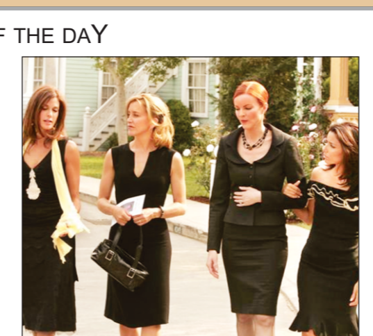
Desperate Housewives On Star World at 8:30pm TV Series Cast: Teri Hatcher, Eva Longoria

BANGLAVISION 08:00 Tele Film: Ekhon O Kuasha 11:00 Musical Programme: Just Band 11:10 Apnar Ki Kichhu Bolar Achhey 11:10 Shomoy Ashomoy 11:40 Media Bhubon 01:00 X-Crime 02:30 Bhokab 02:40 Drama Serial: Kachhey Durey 03:15 Banglavisision Cafe 04:15 Public Forum 05:00 Ebong Classer Bairey 05:40 Diner Sheshey 06:35 Music Moment 08:15 Drama Serial: Shesh Odhay 08:55 Aman Ami 09:30 Drama Serial: Bachelor Dompoti