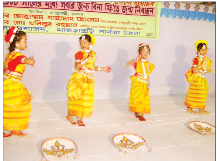
Children dance at the programme

Students from different institutions, UP Chairmen and members, representatives of different NGOs and government officials were present at the event.