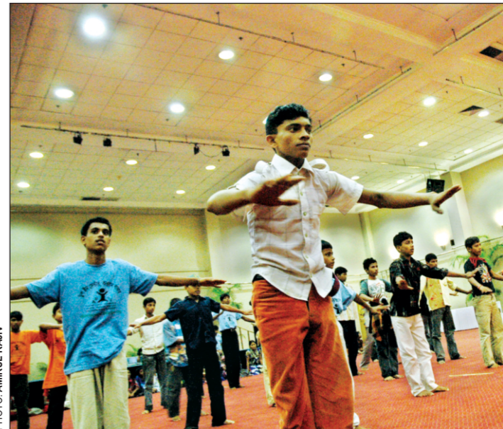
Youngsters of 'Padakhep' rehearse at Winter Garden, Dhaka Sheraton Hotel