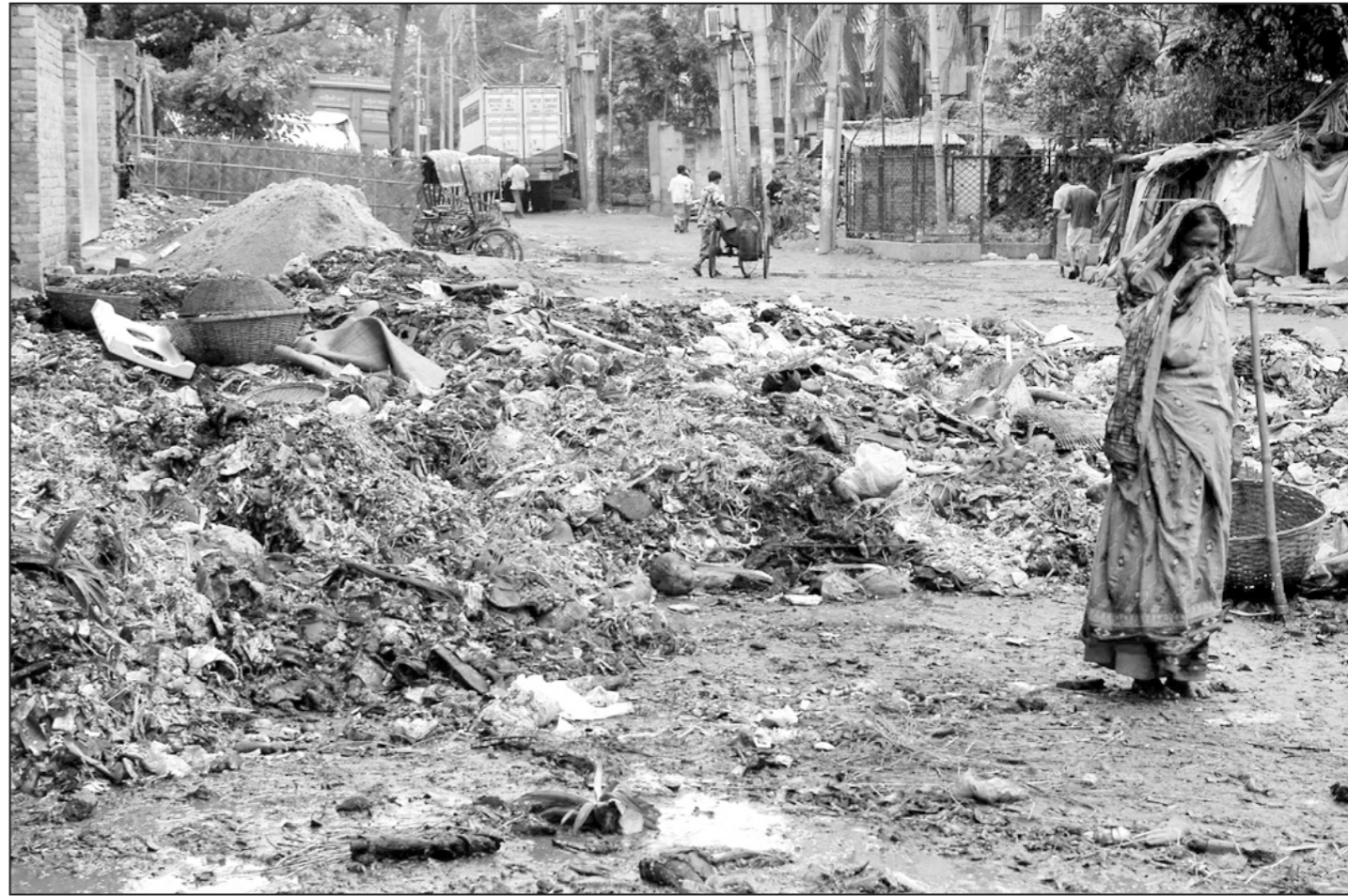
Garbage continues to pile up on a road at Nakhla para in the city, polluting the environment and posing health hazards to locals and passers-by.

The course focused on enhancing capacity of the trainers of police department. The contents included training needs assessment, setting course objectives, curriculum development, lesson plan preparation, training methods, communication and presentation skills, training assessment and evaluation.