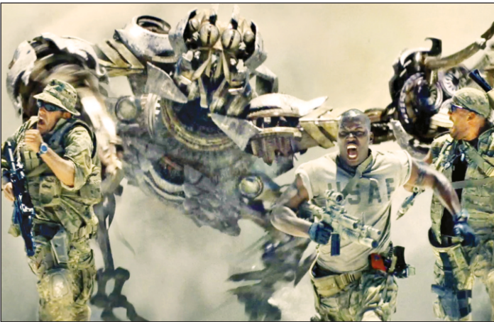
A scene from Transformers