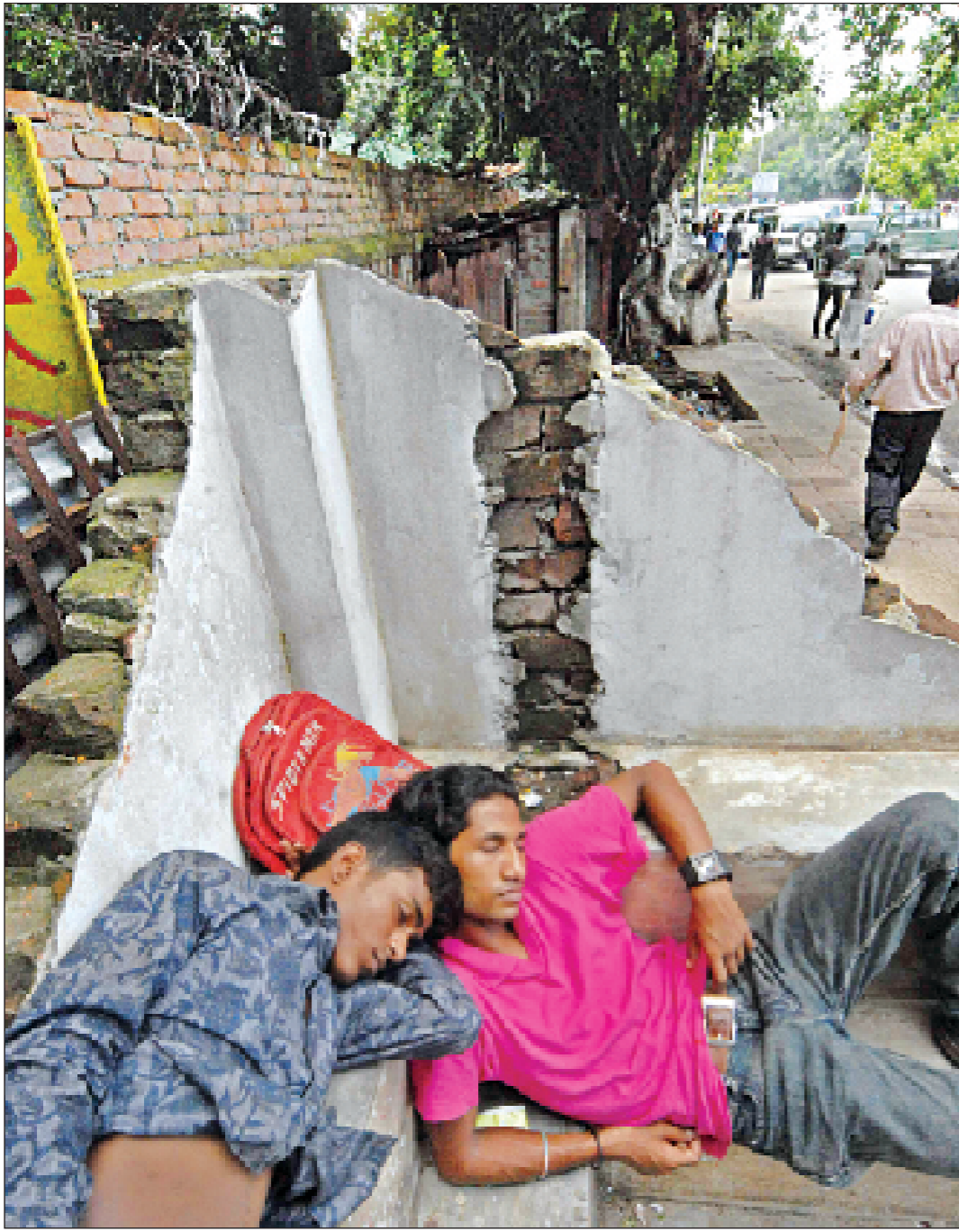
Two flower sellers sleep in what was their makeshift shop at Shahbagh after the police demolished illegal structures on a footpath during an eviction drive yesterday.