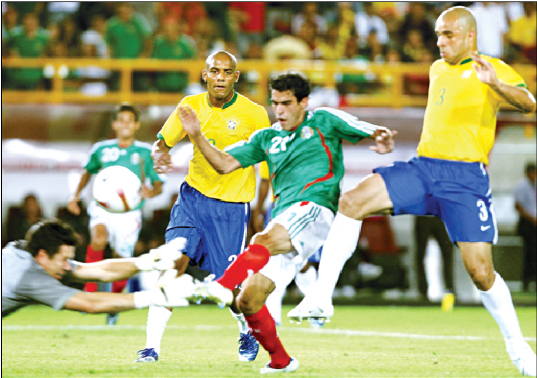
Mexico striker Nery Castillo (C) shoots the ball past Brazilian goalkeeper Doni as Maicon (L) and Alex (R) look on during their opening Copa America match at Puerto Ortaz in Venezuela on Wednesday.