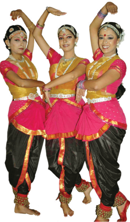
anti-drug song, Esho na boli madok ke na boli .