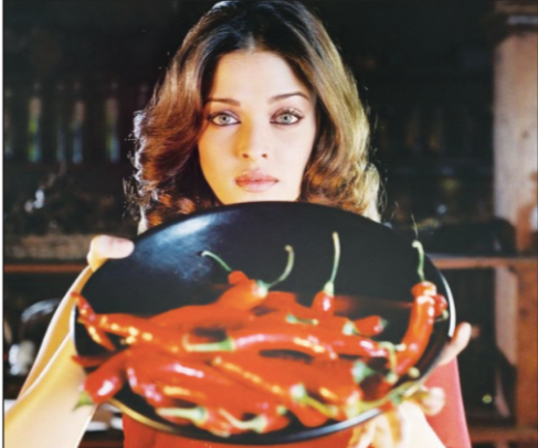
The Mistress of Spices On Star Movies at 8:45pm Genre: Drama / Romance Cast: Aishwarya Rai, Dylan McDermott

All programmes are in local time. The Daily Star will not be responsible for any change in the programme.