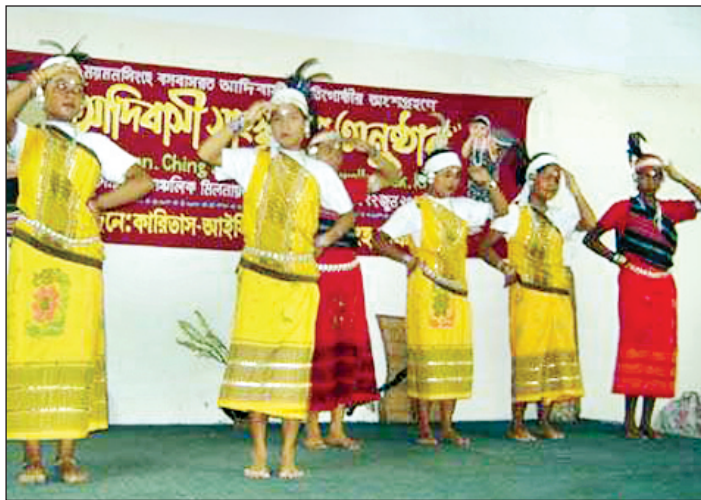
Indigenous artistes perform at the event

Cultural groups from ethnic communities living in Mymensingh, Tangail, Jamalpur, Sherpur, Netrokona and Sunamganj district held a programme at the CARITAS Regional Auditorium in Mymensingh town recently. The cultural programme titled "Hai un Ching an, Ching Dak Bewalko Rak Kina" (Come to practice and revive our traditional indigenous culture) indicates a positive meaning. The event was attended by hundreds of indigenous artistes in colourful traditional attire. Several indigenous groups including Garo (traditionally known as "Mandi"), Kooch, Hajang, Banai, Dhalu and Barman took part at the function. Guri Boua and Chambil dance of the Garos entertained the