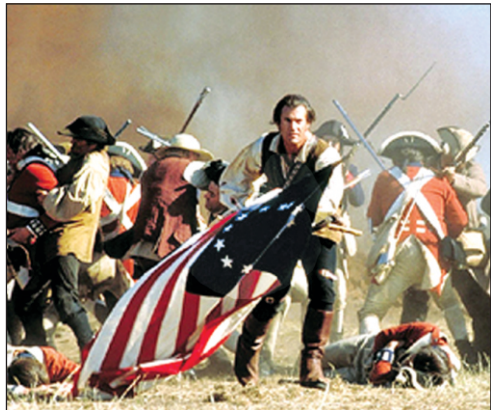
The Patriot On Star Movies at 7:00pm Genre: Action Cast: Mel Gibson, Joely Richardson

10:30 Gallery 11:00 American Cinema 12:10 Talk Show: Ei Shomoy 01:05 Japan Video Topic 02:30 Chokkor 03:15 Drama Serial: Ranger Manush 03:50 Drama Serial: Neer Dibidho 04:25 Bhalobasha Karey Koy 04:50 Apnar Jigyasha 05:30 Togore Song 06:50 Ki Kotha Tahar Shatey 08:15 Cooking Programme 08:50 Kichhu Kotha Kichhu Gaan 09:45 Drama Serial: Neer