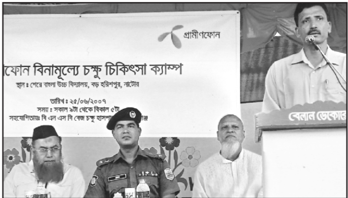
Grameenphone and Sight Savers International jointly organise two-day 3rd free eye camp that began at Sher-e-Bangla High School at Horishpur in Natore yesterday.