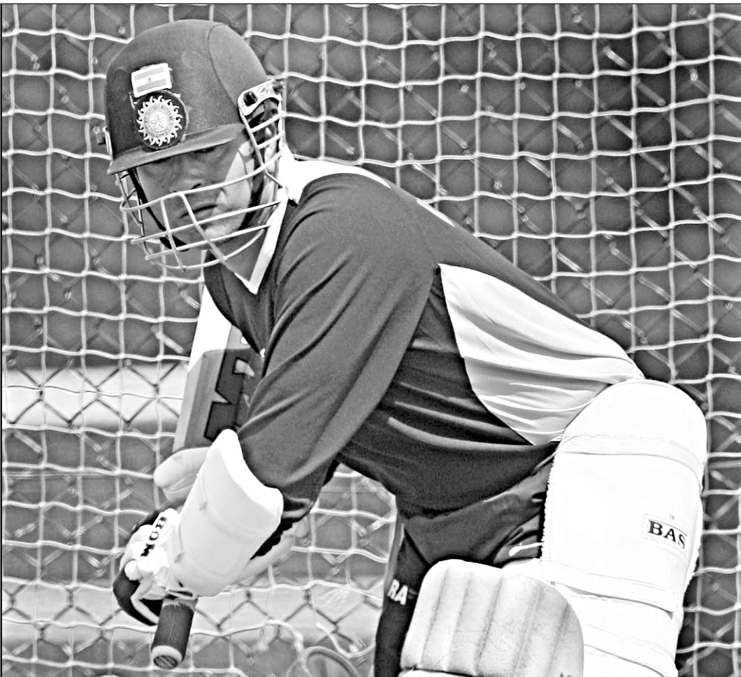
Indian superstar Sachin Tendulkar bats in the team's first net session at Stormont in Belfast on Thursday. India are in Northern Ireland to play three ODIs against South Africa.

FROM PAGE 24 harassments of which Real Madrid have been involved in for over a year to damage A.C. Milan in relation to the player Kaka. "The alteration of a photograph of Kaka, which otherwise is a completely neutral one, seems to re-enter in this manoeuvre, directed to create in the readers the erroneous conviction that Kaka expects nothing other than to move to Real Madrid. "And this does not answer to the truth, as not only the player but A.C. Milan have repeatedly declared in the publication."