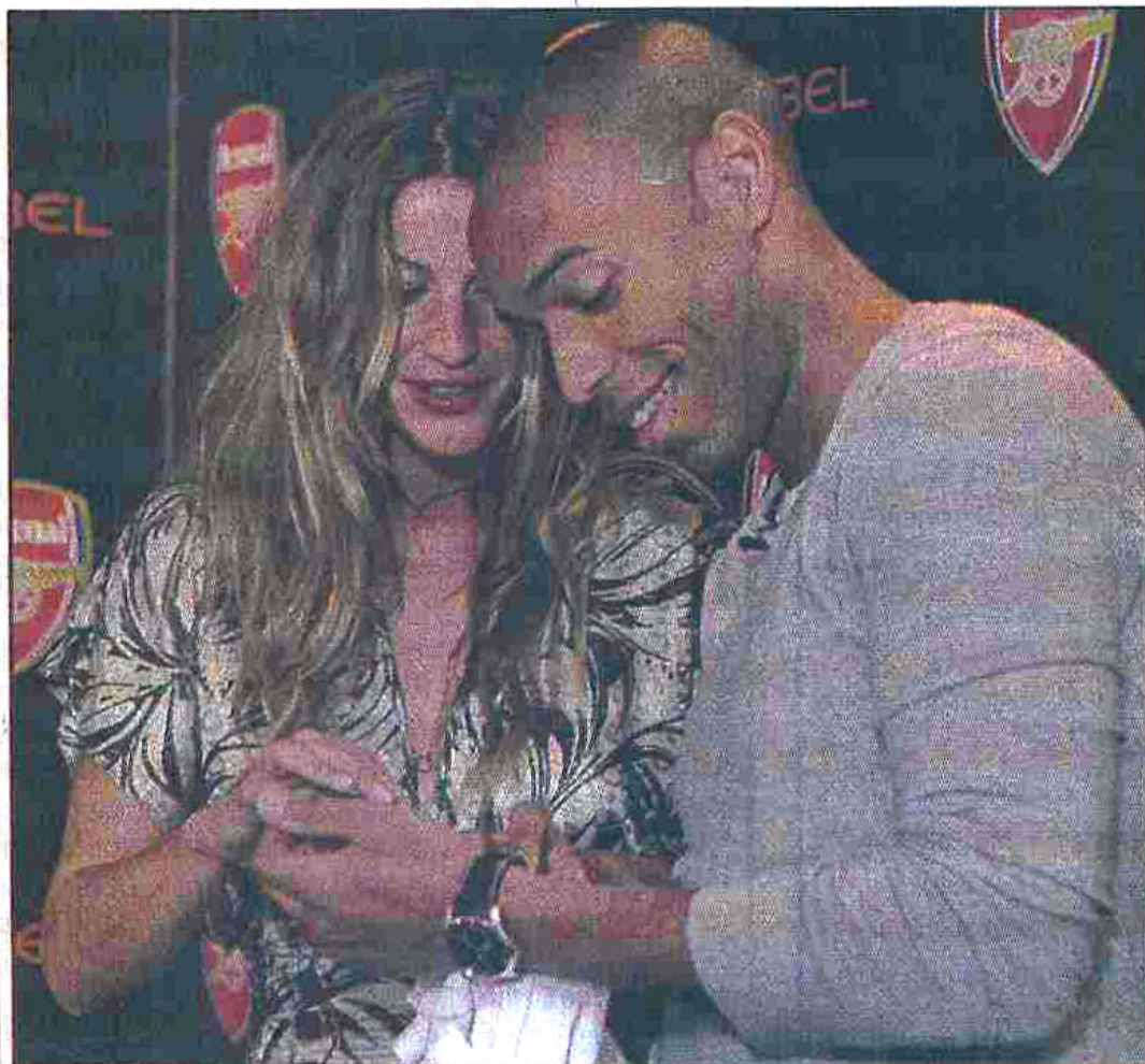
Brazilian supermodel Gisele Bundchen (L) presents an Ebel watch to French superstar Thierry Henry during a photocall in London, arranged to announce the luxury Swiss watch brand as the official partner for Arsenal.