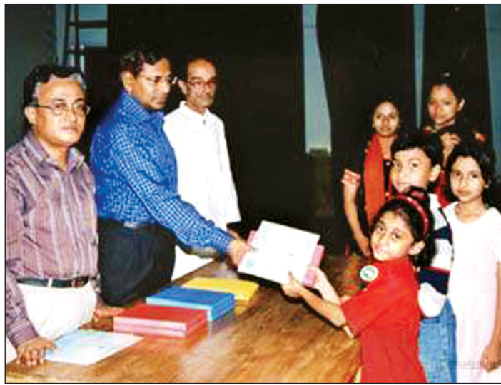
Children receive prizes at the programme

The writer is a Lecturer at Department of English, Metropolitan University, Sylhet