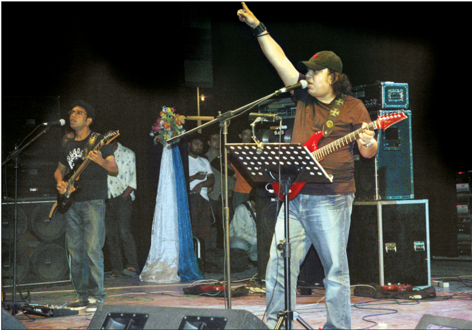
Bands LRB (top) and Face to Face perform at the concert