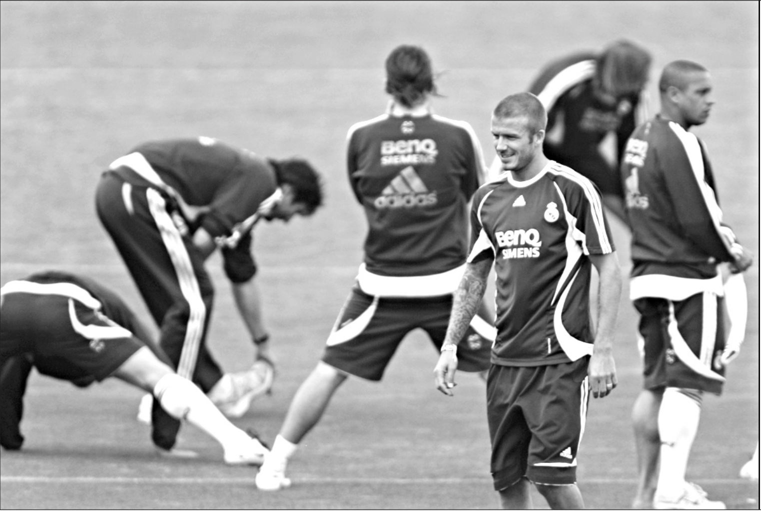
(L) Real Madrid midfielder David Beckham leaves the pitch as teammate Roberto Carlos (R) and others train on at their training ground in Madrid, while in Barcelona, Leonel Messi and Ronaldinho (R) train at their club's training ground, on Friday. The two teams will go all out for victory on the last and title-deciding day of the Primera Liga season.