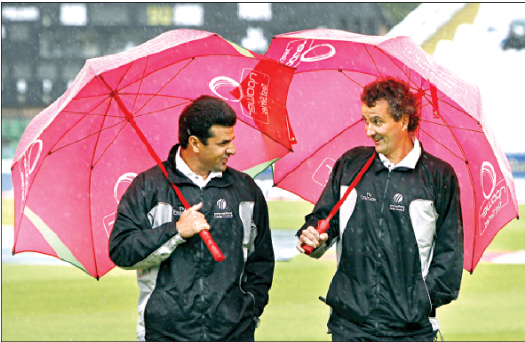
Umpires Aleem Dar (L) and Billy Bowden leave the damp ground after their final inspection on the first day of the fourth Test between England and West Indies at the Riverside Stadium in Durham on Friday.