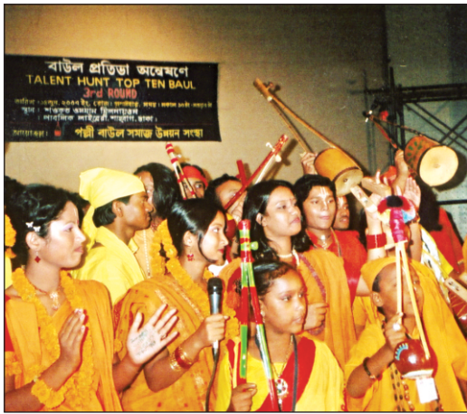
Young contestants at the talent hunt