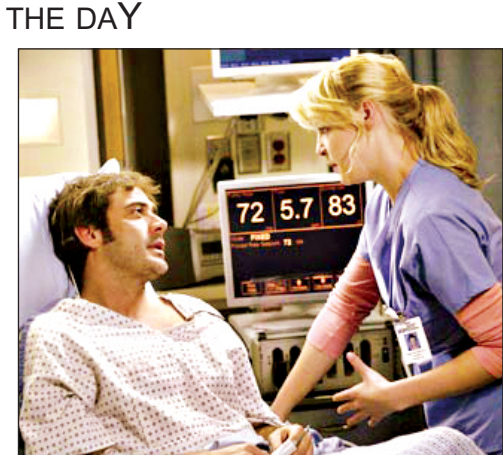
Grey's Anatomy On Star World at 09:30pm TV Series Cast: Katherine Heigl, Jeffrey Dean Morgan

BANGLAVISION 10:10 Apnar Ki Kichhu Bolar Achhey 11:10 Shomoy Ashomoy 11:40 Media Bhubon Drama Serial: Kachhey Durey 03:10 Drama Serial: Dhula Ura Din 04:15 Public Forum 05:00 Ebong Classer Bailey 05:40 Diner Sheshey 06:35 Music Moment 08:15 Drama Serial: Shesh Odhay 08:55 Amar Ami 09:30 Drama Serial: Bachelor Dompoti BOISHAKHI 08:00 Din Protidin 09:00 Cartoon 09:30 Talk Show: Jonotar Kath Goray 12:00 Islamic Programme 01:25 Cooking Show 02:00 Drama 03:30 Kashem Malar Prem 04:00 Game Show 05:00 Cartoon 05:30 Musical Programme 06:00 Nazrul Song 07:15 Quiz Show 07:45 Drama Serial: Polatok Drama 09:15 Talk Show: Law and Development STAR MOVIES 09:30 The Big Green 11:15 Happy Gilmore 12:50 The Mistress Of Spices 02:30 On The Lot 03:30 Opening Night 04:00 Robots 05:30 Spymate 07:00 The Perfect Catch 08:45 Star Wars: Ep. VI - Return Of The Jedi 11:00 A Passage To India 01:45 Spymate 03:15 New France 05:45 Star Wars: Ep. Vi - Return Of The Jedi STAR PLUS 09:00 Bolly V - Star Plus 09:05 V Trailers - Star Plus 09:30 Saans 09:30 V Trailers - Star Plus 10:00 V Trailers - Star Plus 10:30 Aladdin 11:00 Kim Possible 11:30 Sonpari 12:00 Karishma Ka Karishma 12:25 Bolly V - Star Plus 12:30 V Trailers - Star Plus 12:55 Bolly V - Star Plus 01:00 Shaka Laka Boom Boom Bolly V - Star Plus 01:55