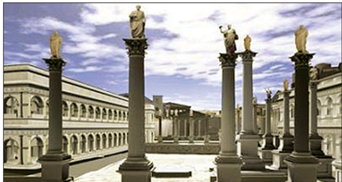
Detail of the new computer model of ancient Rome shows the steps on the back side of the Caesarian Rostra, or speakers' platform, in an image released June 11, 2007. Rome Reborn , the largest simulation of an ancient city ever made, was unveiled last Monday showing the city within the Aurelian walls at its peak in 320 AD, under the emperor Constantine when it had grown to a million inhabitants