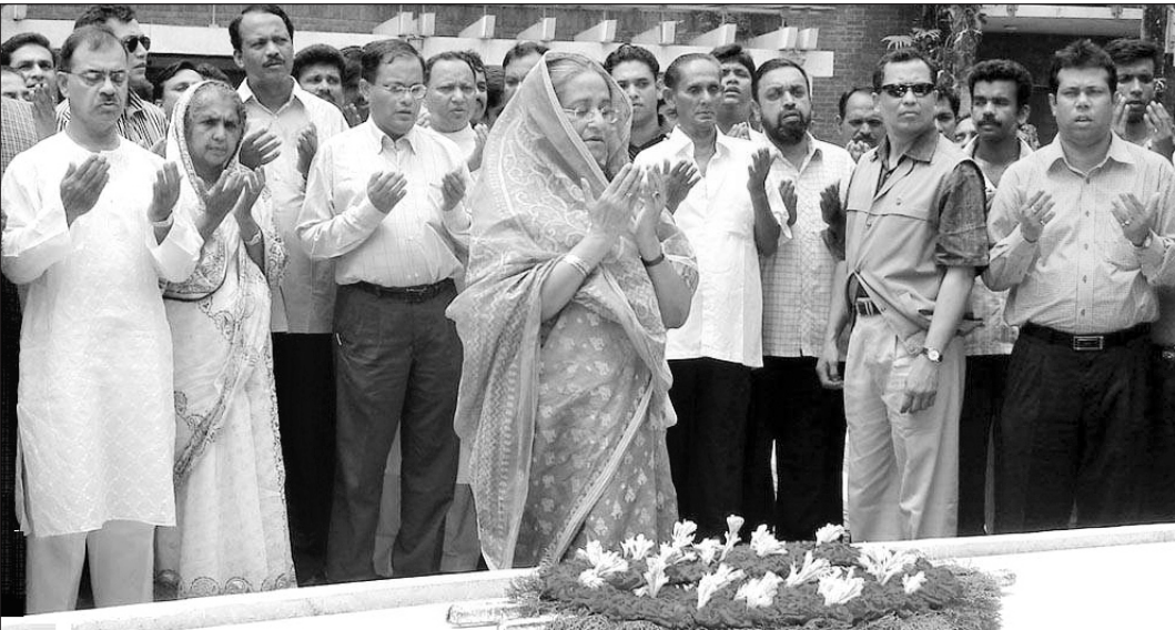
Awami League chief and former prime minister Sheikh Hasina offering fateha at the major of Bangabandhu Sheikh Mujibur Rahman at Tungipara yesterday.