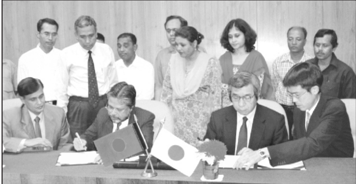
Japanese Ambassador Masayuki Inoue and ERD Secretary Aminul Islam Bhuiyan sign the notes regarding Japanese grant assistance for improvement of the Storm Water Drainage System in Dhaka City (Phase-II), Human Resources Development Scholarships (JDS) and Establishment of the Meteorological Radar System at Moulvibazar at a ceremony in the city yesterday.

ing system is very important because an early warning is the key component for the success of disaster management. Japan has been assisting in the construction of meteorological radar system in Bangladesh in order to ensure the country's sustainable development. In order to adopt preventive measures from natural disaster, the Government of Japan, upon request of the Government of Bangladesh had earlier completed the Basic Design Study for the establishment of Meteorological Radar System in Moulvibazar. The construction of new Doppler Radar Station in Moulvibazar will be most effective for timely forecasting and warning to minimise the damages in lives and properties in the regions. There are also meteorological radar systems in Rangpur, which was built in 1999, and another one in Cox's Bazar, which was inaugurated in April this year. A project to improve such system at Khepupara is going on. The third agreement was signed for Human Resource Development Scholarship (JDS) programme for the next year at a cost of 294 million yen equivalent to Tk 17 crore. Under this programme, the government will start selecting candidates for 7th JDS in August this year. A total of 20 people will be selected for studying in Japan for two years from July 2008.