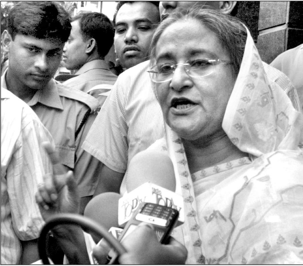
Awami League President Sheikh Hasina talks to reporters in front of her Shudha Sadan residence in the city yesterday.

She left behind her one son and one daughter to mourn her death.