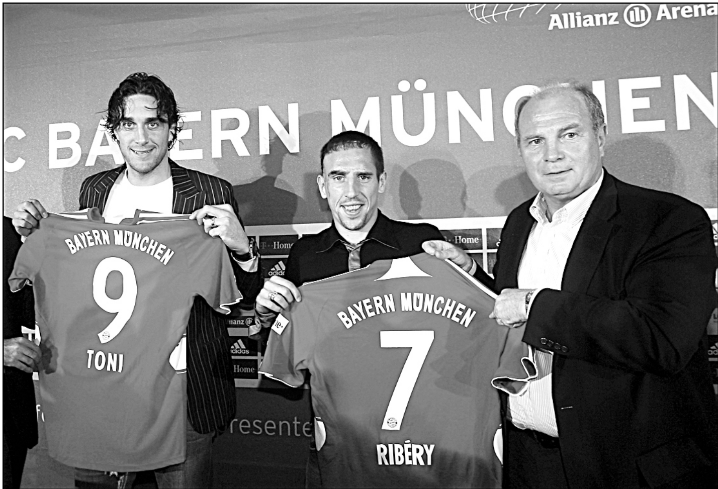
Bayern Munich manager Uli Hoeness (R) presents their two newest acquisitions French midfielder Franck Ribery (C) and Italian striker Luca Toni at a press conference in Munich on Thursday.