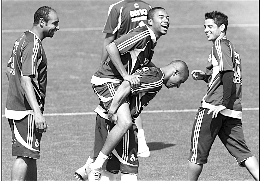
Real Madrid's Brazilian contingent (from L-R) Emerson, Robinho, Roberto Carlos and Cicinho share a light moment during training session in Madrid on Thursday.

No financial details of the 'keeper's new Bianconeri agreement have been released. Buffon joined Juve in 2001 from Parma in a £33m deal.