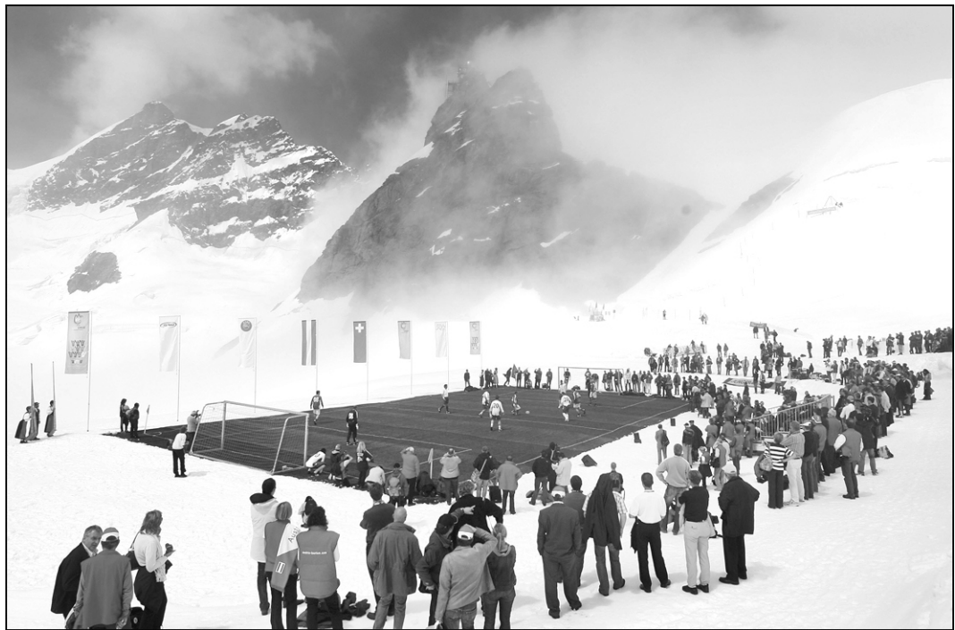
A mix of former and current football players attend an exhibition match on the 3500-metre-high Jungfrau Glacier in Switzerland on Friday to mark a year to go for the Euro 2008 championships to be held in Switzerland and Austria.