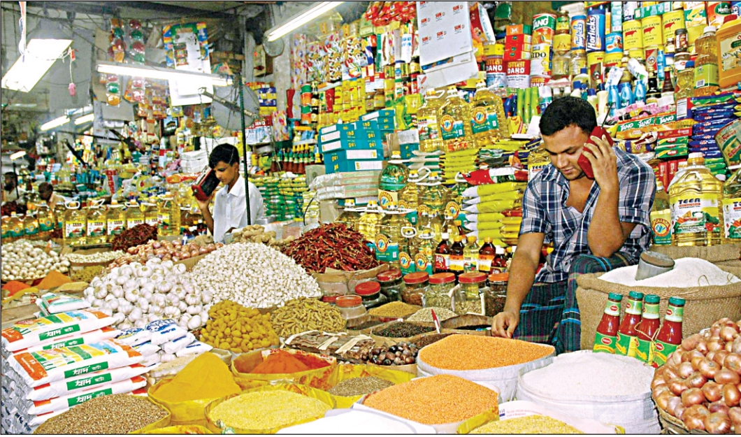
Shopkeepers at Karwan Bazar in the capital yesterday listen to Finance and Planning Adviser Mirza Azizul Islam's speech on the national budget for fiscal year 2007-08 on radio.

"We have taken a pilot project to prepare a new voter list. The project will be complete by the end of June and we will be able to declare a roadmap of elections by the middle of July," the CEC told reporters after the meeting at the EC. He said the Troika delegation enquired about the roadmap of the election, especially regarding the 18-month timeframe. SEE PAGE 19 COL 6