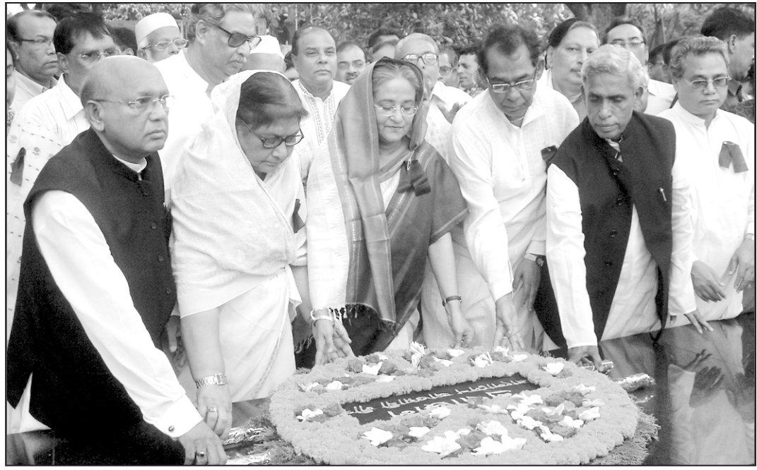
Awami League President Sheikh Hasina along with party leaders places wreaths at the portrait of Bangabandhu Sheikh Mujibur Rahman at Bangabandhu Memorial Museum at Dhanmondi in the city yesterday to mark the historic 7th June.

An 'O' level student and a housewife were electrocuted in separate places in the city during four-hour thunderstorm and downpour last night.