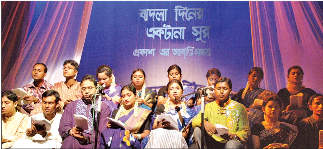
Members of Prokash Shahitya Shangkritik Shangathan during a group recitation